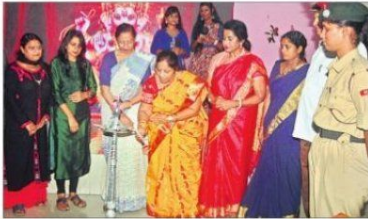
సెమినార్ ను ప్రారంభిస్తున్న ముఖ్య అతిథులు

అల్లిపూరం(విశాఖ దక్షిణం): 'మహిళల రక్షణ కోసం పోరాడుదాం' అని పలువురు మహిళా ప్రముఖులు పిలుపునిచ్చారు. 'విజనరీ వుమెన్' పేరిట ఢిల్లీకి చెందిన తేజస్వి అస్మిత్ ఫౌండేషన్ ఆధ్వర్యంలో విశాఖ ప్రభుత్వ మహిళా డిగ్రీ కళాశాలలో గురువారం నిర్వహించిన సదస్సుకు దేశవ్యాప్తంగా పలు రాష్ట్రాల నుంచి మహిళా ప్రతి నిధులు హాజరయ్యారు. శాంతి, ఆహంస, సమానత్వం, న్యాయ సాధనకు కృషి చేసిన వివిధ రంగాల మహిళల గొప్పద