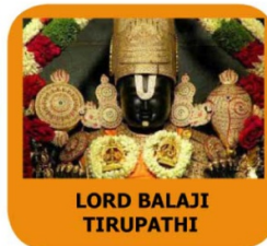
LORD BALAJI TIRUPATHI

FOR TIRUPATHI LORD BALAJI DAR-SHANAM, PLS CONTACT: GEOCARE TOUR ADVENTURES GEOCARE TOUR ADVENTURES Official Travel Partners phone # 8800126010, 9211297887