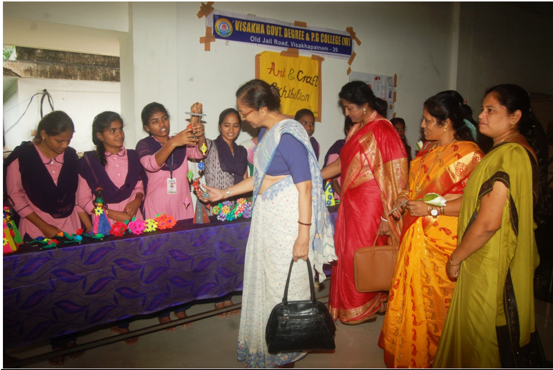
Art exhibition by college students