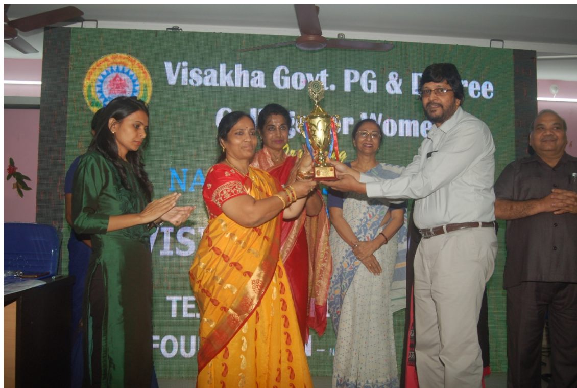
ETHNIC SHOW : DRESS CULTURE OF VARIOUS STATES IN INDIA